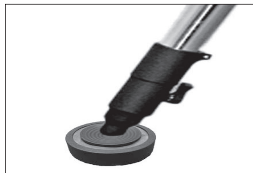
Fig. 2: Place tripod leg into the center of the pad.