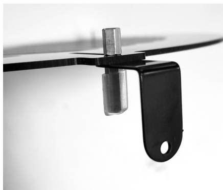
Figure 4. Installing L-bracket

#608022 was designed to fit 12" ACF and Schmidt-Cassegrain telescopes, but it also includes 3 L-brackets which may be used to fit different telescopes for a slightly wider range of apertures. Unthread the Locking Nuts from the Attachment Pegs, then place the L-bracket mounting hole between the Attachment Pegs and Bahtinov Mask and reattach the Locking Nuts (Figure 4). Adjust the distancing as needed so that the L-brackets fit on the outside diameter of the telescope (Figure 5).