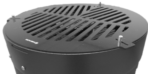
Figure 2. Bahtinov Mask installed